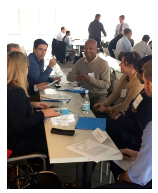
Highway Project Management Partnership Training.

In January, the MassDOT Highway Division and ACEC/MA held a three part joint Project Management Partnering Training program at MassDOT's new Research and Materials